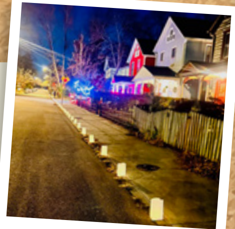
Luminaries on Luttrell. December 2024

In December, the Social Committee pulled off a new and magical neighborhood event. Over 700 lighted lanterns were installed along several blocks of Luttrell. Many neighbors strolled the street and gathered around firepits for hot chocolate and s'mores. Special thanks to the Committee and to the Howards and Kay Newton for hosting the firepits at their homes.