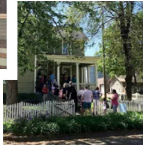
RIGHT 1000 Eleanor home on 2019 tour