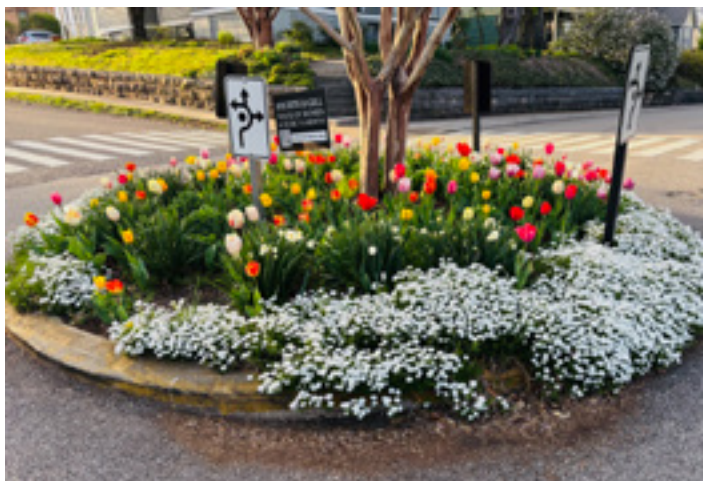
Spring in bloom at Luttrell traffic circle