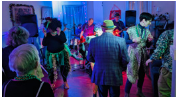
Attendees at the Mardi Gras celebration at The Birdhouse