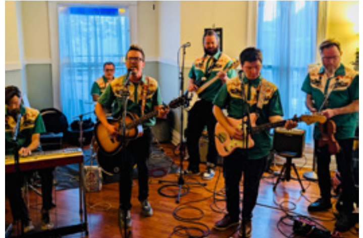
New Market Train Wrecks performing at The Birdhouse