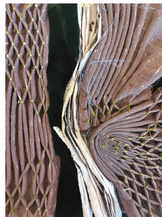
Above: Artwork in progress (above)