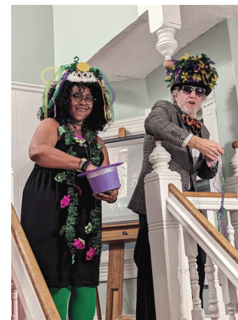
Queen and King of the Birdhouse Neighborhood Center Mardi Gras

Neighbors receive half off the already low rental prices for the first floor and outdoor space at the BNC! Learn more at www.fourthandgill.org/birdhouse-neighborhood-center .