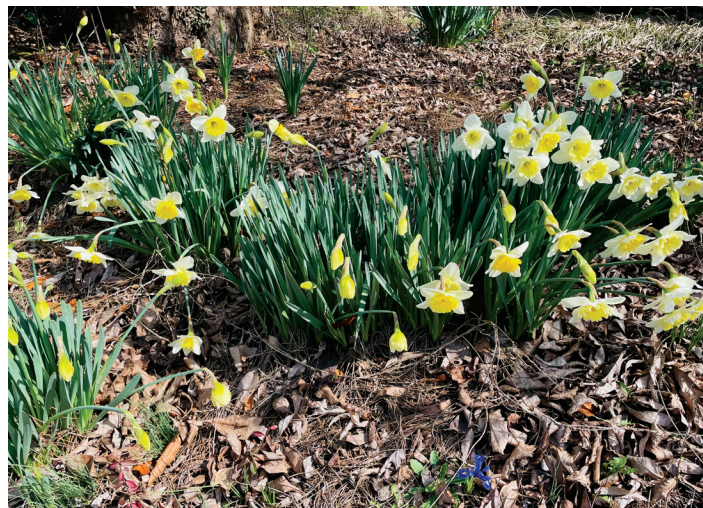
Spring came early this year, as evidenced by some February daffodils